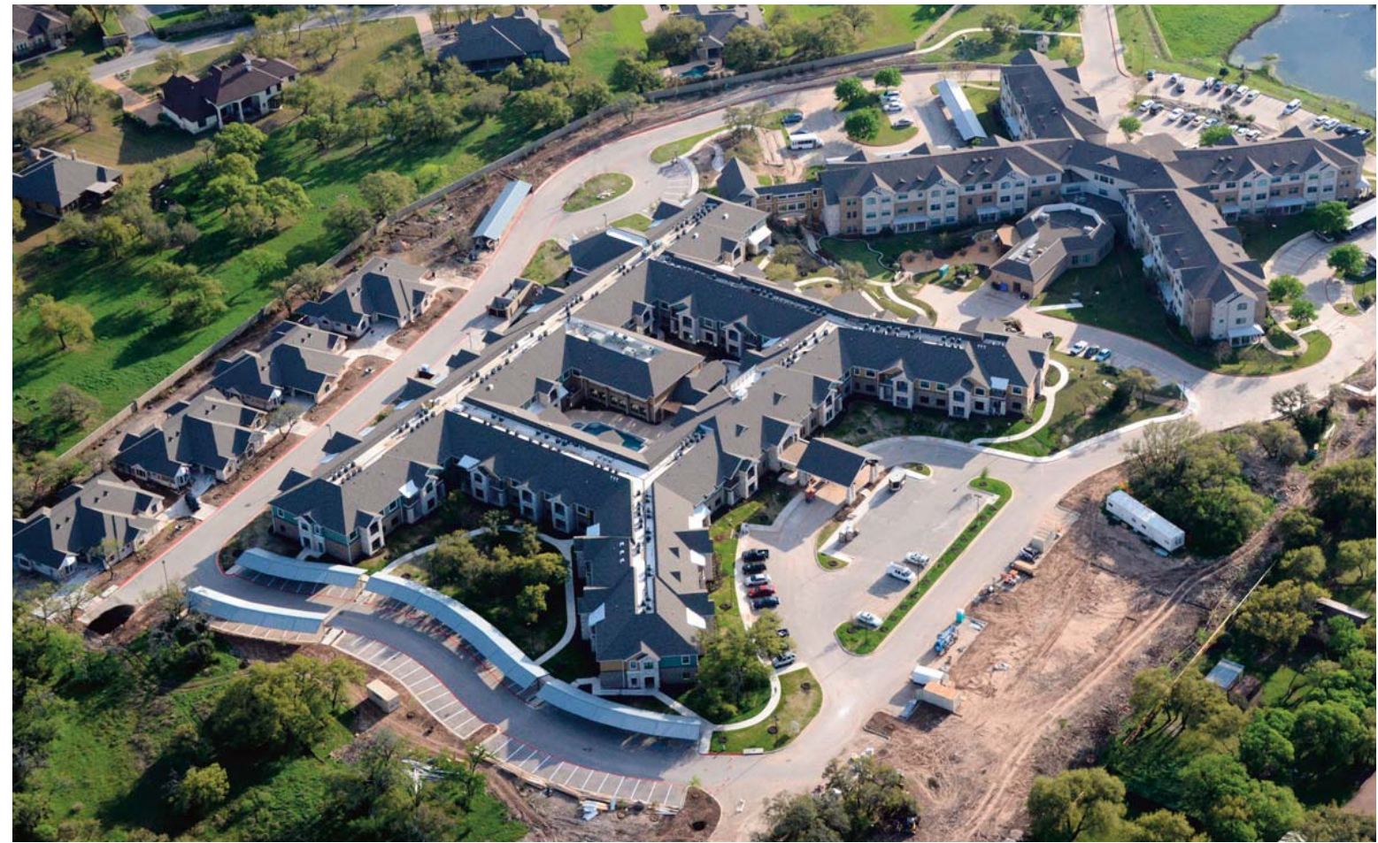
An aerial photo taken of The Wesleyan at Estrella Independent Living on March 17, 2017.